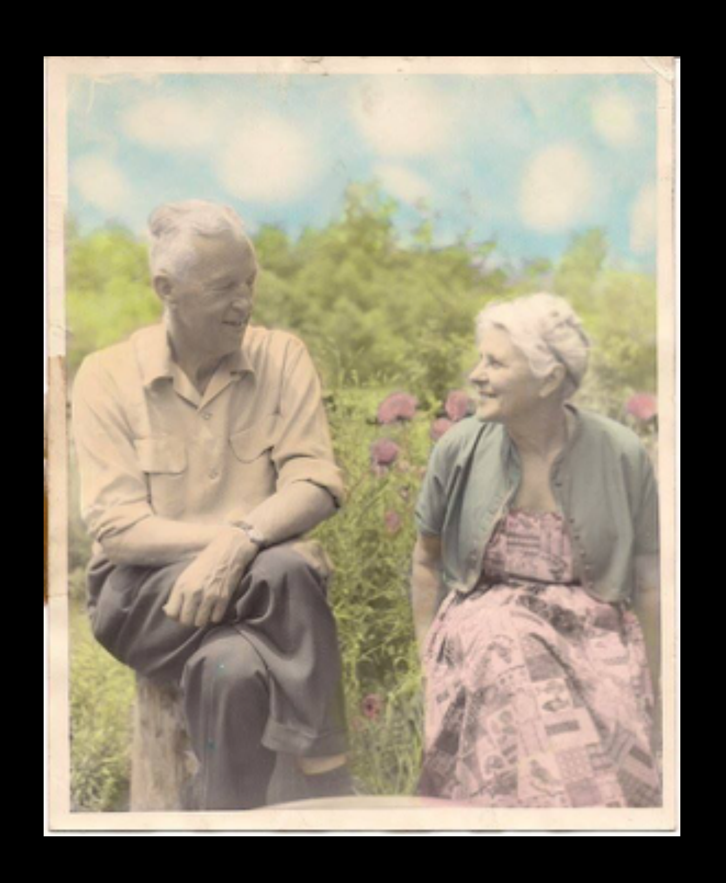
(1) Lois Remembers, (B-7) p. 133

We were told by a tour guide that Bill's version was more like 'We broke in through the window!'