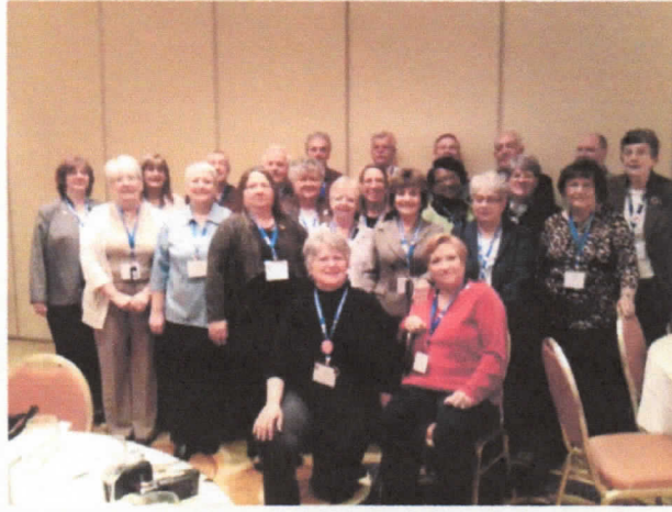
Panel 52 Delegates