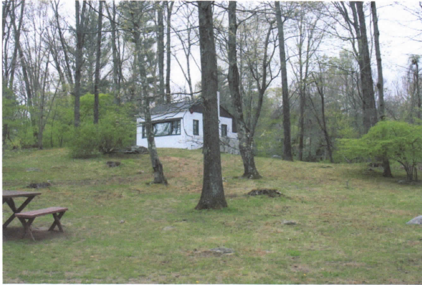
Wit's End - Stepping Stones