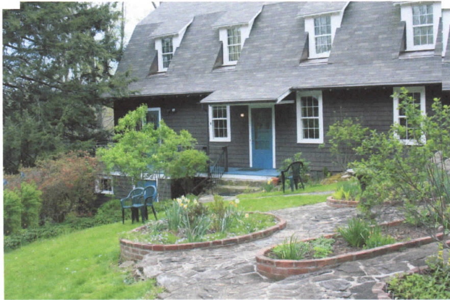
Home of Bill & Lois Wilson in Bedford Hills, NY