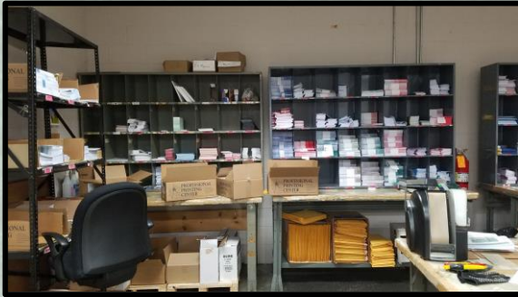
WSO: Room for shipping pamphlets