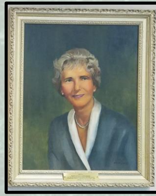
Lois W. and Anne B., Al-Anon Co-Founders